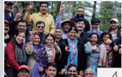
Together Towards Glory CRBG Annual Conference 2019

Contributions to NBP Newslines may be sent to Strategic Marketing Division, Service Quality Group, 2nd Floor, Head Office, Karachi.