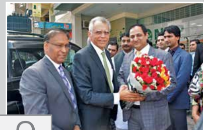
9 President visits Faisalabad