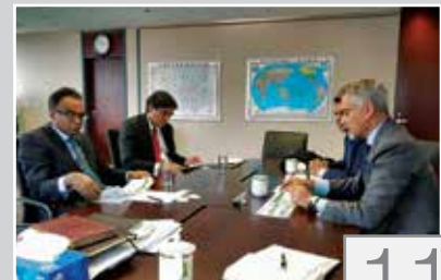
11 NBP at Pakistan-China Trade & Investment Forum Beijing-China